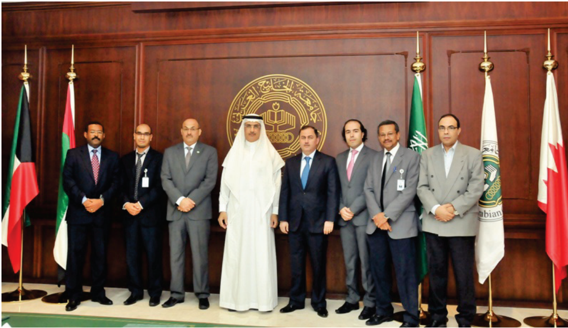
Group picture showing representatives from both institutions.